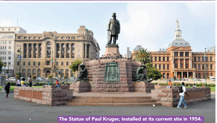
The Statue of Paul Kruger, installed at its current site in 1954.