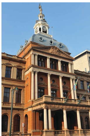
Tant Gesie's balcony, with hanging flags just above the building's main entrance.

President Paul Kruger's Eerste Volksraad held its sessions in the raadsaal or council chambers. On the east side of the Old Raadsaal, a steep flight of stairs leads up to the first floor where offices for lower ranking officials are situated. Here the passages have wooden floors and the walls are more simply decorated. Another half flight of even steeper stairs leads to the three balconies on the east side of the Eerste Volksraad chamber. The middle one was known as Tant Gesie se balkon .