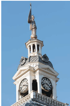
The Tower Statue, situated on the pinnacle of the tower above the Raadsaal's clock.

There has been much speculation about the statue of a woman on the pinnacle of the tower above the clock of the Old Raadsaal. Resembling a ship's figurehead, the idea of having the figure of a woman on the government buildings rankled the conservative president. He claimed to have had enough trouble with his opponent, Queen Victoria. There is even a story that he was unhappy because her head was uncovered and so they allegedly screwed on a helm.