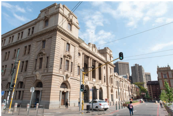
The Post Office building as it looks today.

The General Post Office is situated on the north-western side of Church Square. Its location on the main square is typical of many world cities. Postal services reached the Transvaal in 1850 and five years later Pretoria was included on the postal route when transport drivers were replaced by mail coaches.