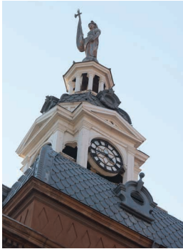
The Old Raadsaal's Clock Tower, just below the Tower Statue.

Four bells were specially cast in Germany for the Old Raadsaal's clock and bell tower. Each of the bells was engraved. The first had the words: Staatspresident Paul Kruger (State President Paul Kruger), the second Het recht den volkeren is aan onze zijde en hoe zwak wij zijn onze God is een rechtvaardig God (The right of nations is on our side and however weak we seem, God is just), on the third Onze leus is de leus onzer vaderen: Eendracht maakt macht (Our watchword is the