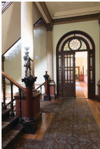
One of the Ou Raadsaal's many hallways are richly decorated, from the balustrades to the doorknockers.