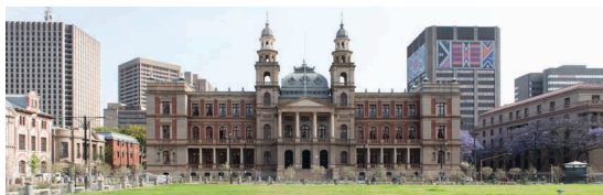
The Palace of Justice, where the Rivonia Trial of 1963 took place.

The Palace of Justice on the northern side of Church Square was designed by Sytze Wierda in 1895. In neo-Italian Renaissance style, it was his last masterpiece and shows interesting deviations from other buildings which he designed for the state. In virtually all his buildings he used one central tower to mark the entrance, whereas in this one he used two towers flanking the main entrance. The large horizontal, colonnaded balconies of the Church Square façade are representative of Wierda's innovative style (later copied by Sir Herbert Baker). The openness of the building's northern façade and its elegantly curved staircase also contrast with the solid style of most of his other buildings.