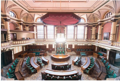
The Ou Raadsaal Chambers, which forms the heart of the stately building.

The heart of this stately building is the raadsaal or council chamber. Placed beneath the central dome, the massive chamber, now fully restored to its original glory, is impressive with its heavy walnut chairs covered with dark green Moroccan leather, contrasting with the patterned carpet specially woven according to old photographs and colours deduced from patches of paint here and there on the walls beneath many layers.