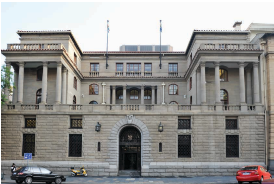
The Old Reserve Bank, designed by Sir Herbert Baker.