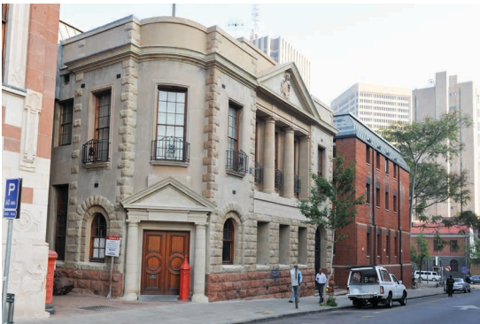
The National Bank building, which housed the first ever Transvaal Bank.

The National Bank building, next to the Post Office, housed the first Transvaal Bank, which was founded specifically to administer the government funds of the Zuid-Afrikaansche Republiek. The Nasionale Bank en Munt der Zuid-Afrikaansche Republiek was established in April 1891, the main reason being that, as an independent country, especially one producing its own gold, the country had to have its own bank and its own mint. The Bank and Mint building was built in 1892. The Mint, which was temporarily housed in the Kimberley Hotel on the same site, was the first in the southern hemisphere. It is located towards the back of the Bank building. In 1899, president Paul Kruger gave his friend, Sammy Marks, permission to use the mint for one day to mint 215 gold ticks for his friends and family. Kruger did this to thank Marks for the statue of himself, which Marks had commissioned. The tall and narrow annex to the north of the bank was built in 1903 to provide extra office space for both the Bank and the Mint. The Jugendstil influence can clearly be seen. The Mint machine room was at the back of the building. On the inside, between the bank building and the annex, is a beautiful wrought-iron gate. The façades of the building were restored in 1986.