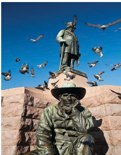
Oom Paul Kruger's statue, the work of famous sculptor Anton van Wouw.

Church Square is today dominated by a statue of president Paul Kruger. The statue has, however, not always stood there. After the second church in the