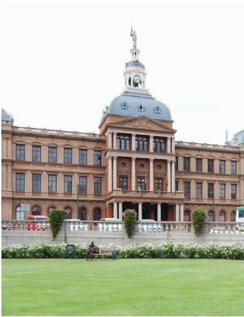
The Old Raadsaal building, the first ever parliament of the Zuid-Afrikaansche Republiek.

Since the first meeting of president Paul Kruger’s ZAR Volksraad in the Old Raadsaal in May 1890, this historic seat of government has seen all the central figures of South Africa’s vibrant story cross its threshold.