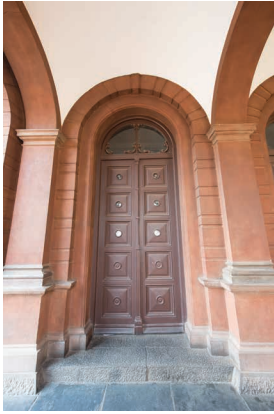
The front door leading into the Ou Raadsaal building.